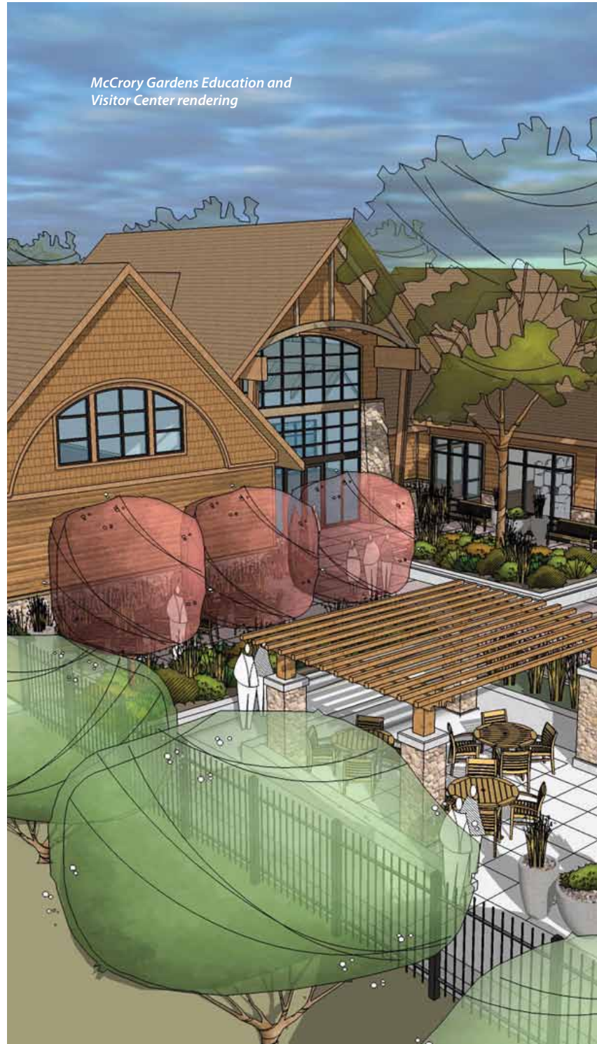
McCrary Gardens Education and Visitor Center rendering