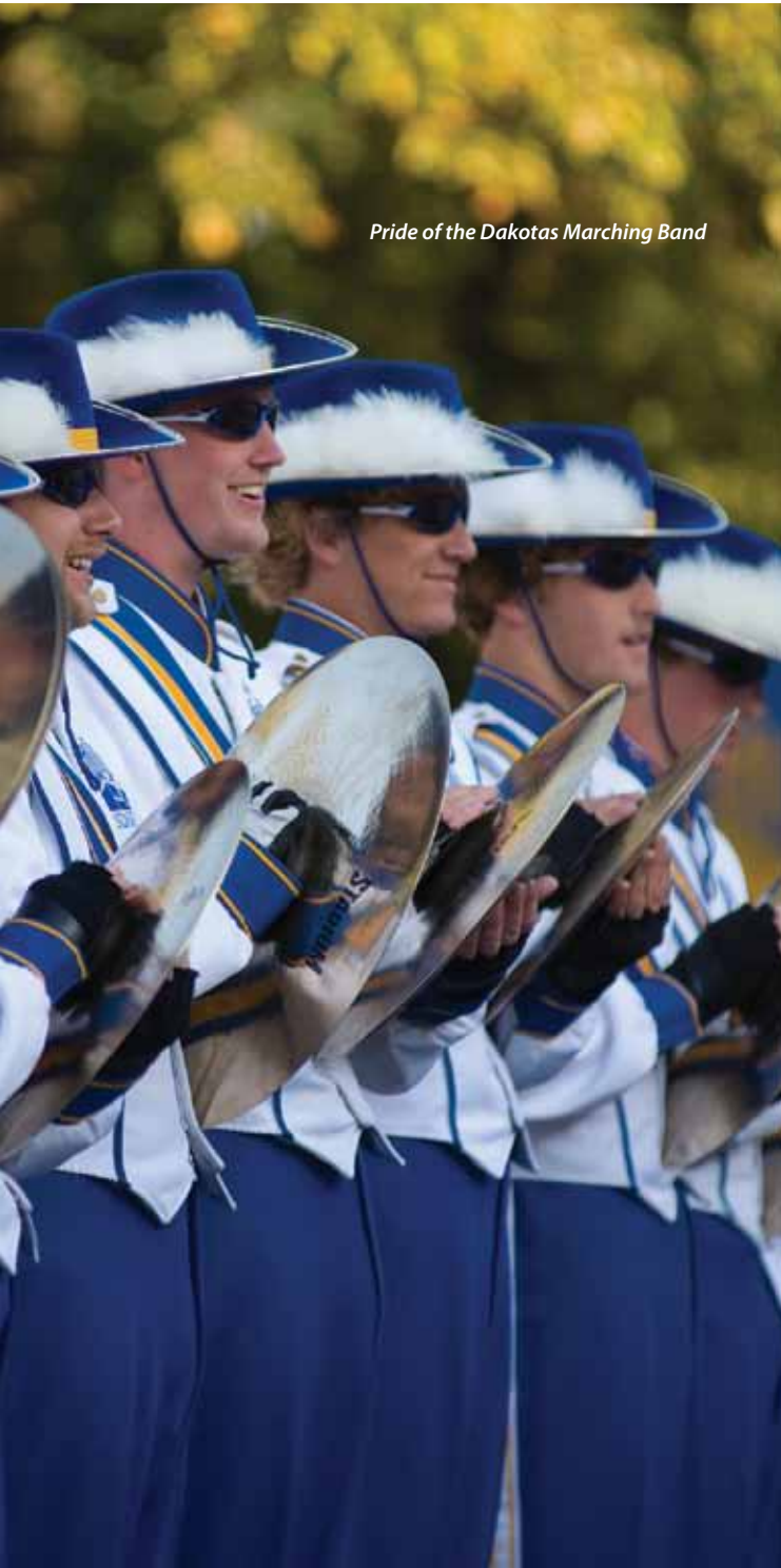
Pride of the Dakotas Marching Band