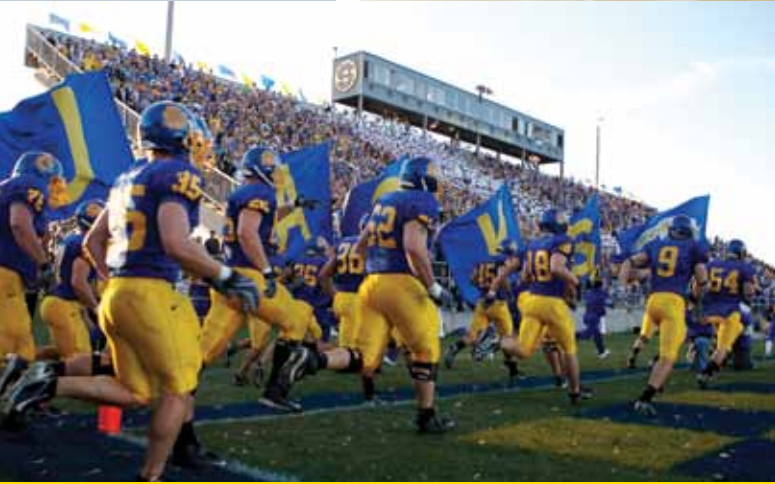
Jackrabbit football team