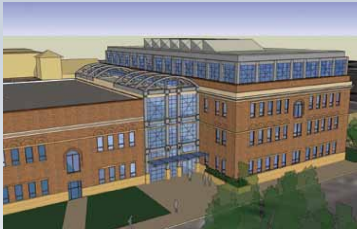
Mathematics and Engineering Building rendering

■ Seed Technology Laboratory — The Seed Technology Laboratory ($6.4 million) is a cornerstone to the research, teaching, extension outreach, and technical service capabilities in seed and crop science, technology, and biotechnology. Located at the SDSU Innovation Campus, the only university-affiliated research park in the state, the facility was formally dedicated on September 18, 2010.